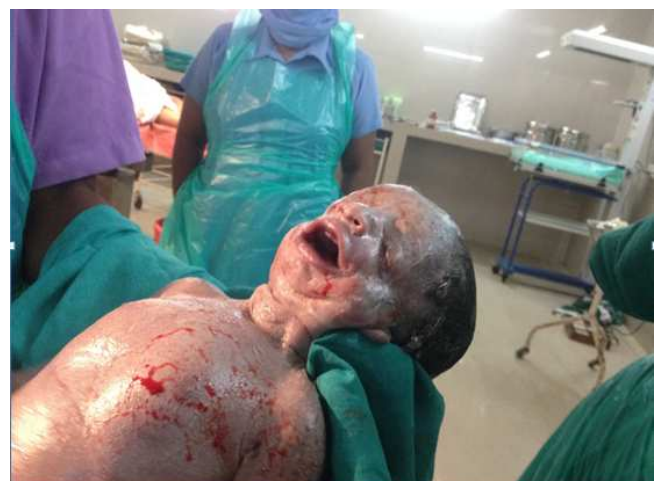
Fig 4: New born