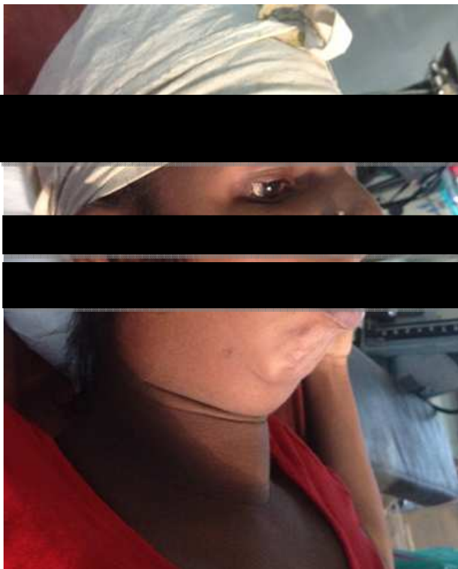
Fig1: Patient with TCS