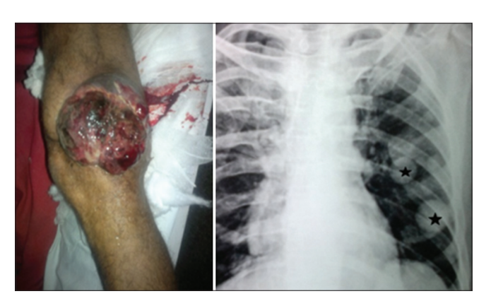
Figure 4: Synovial sarcoma of knee with pulmonary metastasis (stars) managed by palliative transfemoral amputation