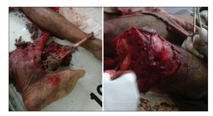
Figure 2: Traumatic (road traffic accident) knee disarticulation patient at the time of arrival in the emergency department

Figure 3). Of the six cases with limb malignancy, in four amputation was the definitive modality of treatment and in