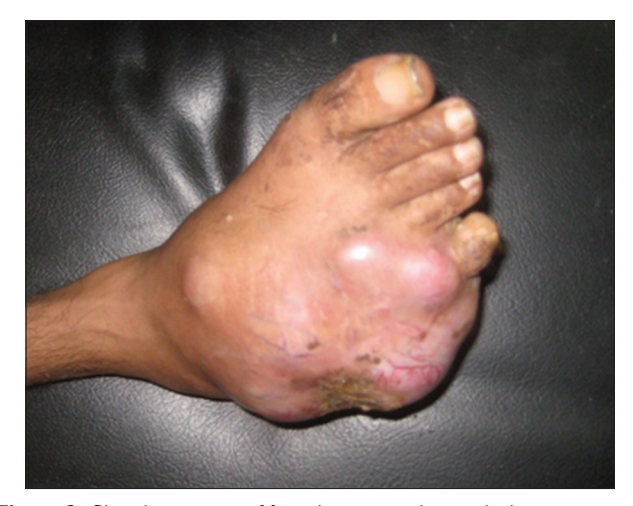
Figure 2: Chondrosarcoma of foot that required transtibial amputation

PVD: Peripheral vascular disease, LLA: Lower limb amputations